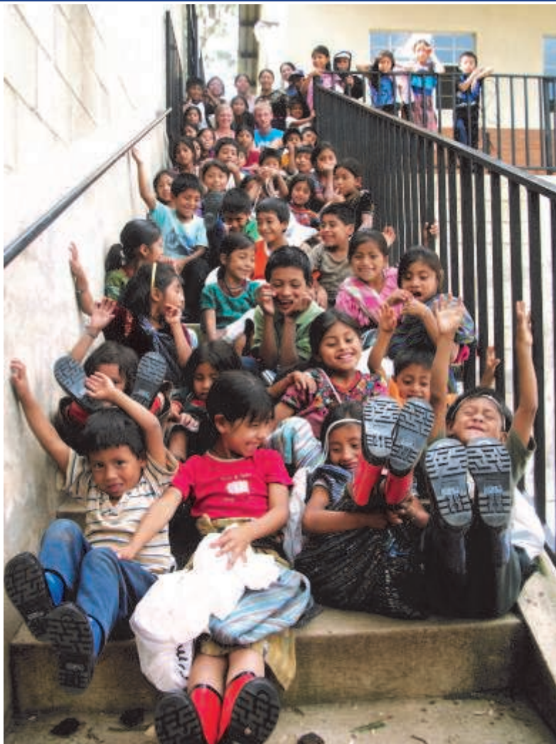
Children at the El Yalu VisionTrust Learning Center

Door Creek Church has made this Learning Center possible through the sponsoring of over 20 children and also with a $10,000 donation from the 2010 Advent Conspiracy Campaign. Through these funds we have been able to hire teachers and run the Learning Center. It is our prayer that we can continue to partner together to love these children and to add an additional 50 children in 2012.