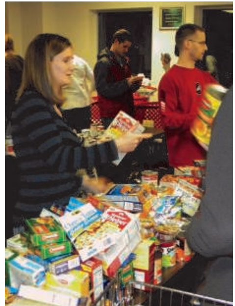
Fusion helping sort food