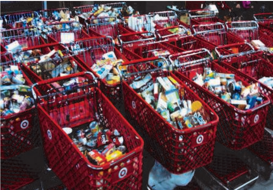
Taken in the Atrium at Sprecher Road Campus

Thank you to the many students, parents, young adults for your hands on serving. Thanks also to Boomerangs Resale Store for the use of the truck and to Target for the use of shopping carts.